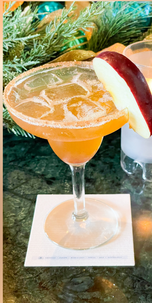
Spiced Christmas Margarita