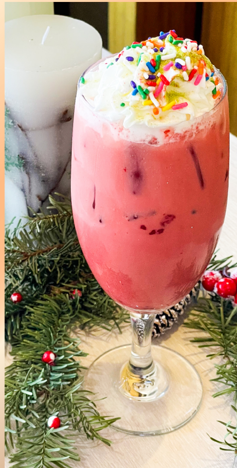
Red Velvet Latte

We have festive libations for every time of day.