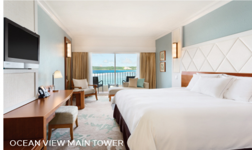
OCEAN VIEW MAIN TOWER