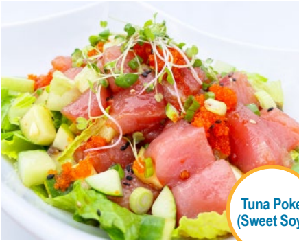
Tuna Poke (Sweet Soy)

CALL 671-646-1820 EXT. 5355 TO PLACE YOUR ORDER