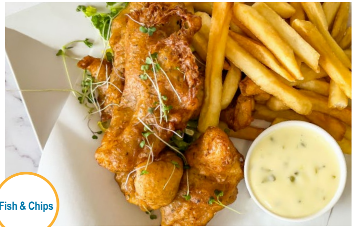
Fish & Chips

Grilled Herb Chicken, Lettuce, Tomato, Onion, Bacon, Mayo, Swiss Cheese, Over Hard Egg & French Fries