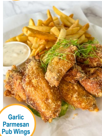
Garlic Parmesan Pub Wings