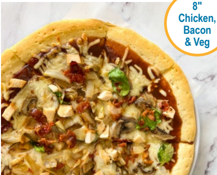
8" Chicken, Bacon & Veg