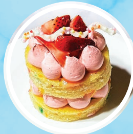
Strawberry Birthday Cheesecake