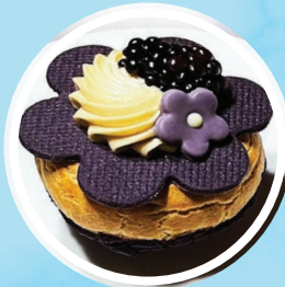
Earl Grey Blackberry Puff