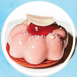
Raspberry Lychee Macaron