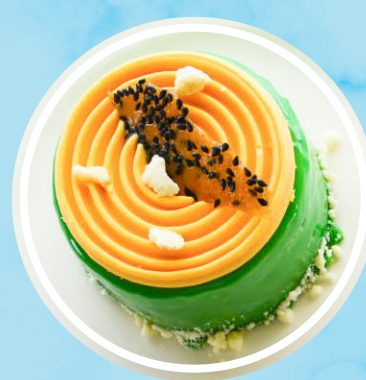
Black Sesame Calamansi