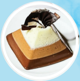
Triple Chocolate Mousse