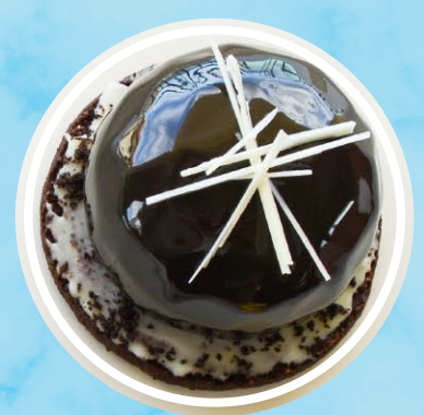
Cookies & Cream